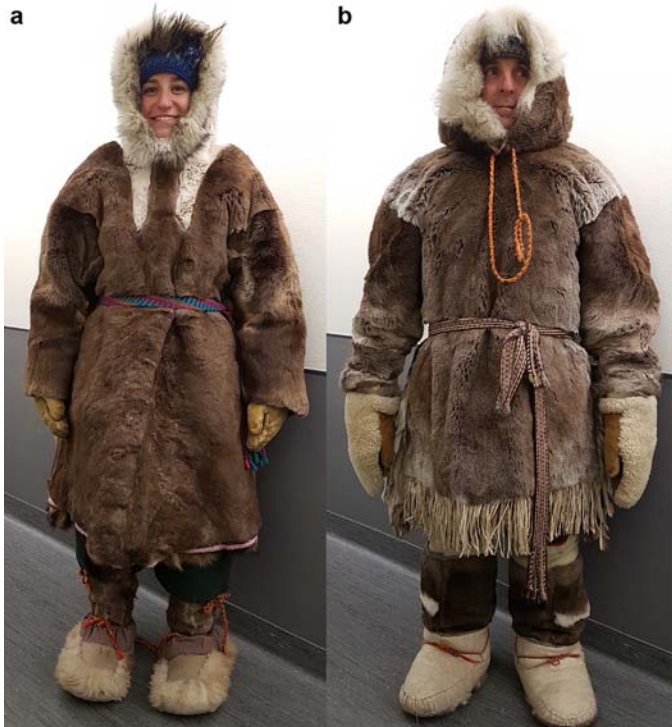
FIG. 1. Subjects wearing the two caribou-skin outfits. Subject 1 (a). Subject 2 (b). Each subject was similar in gender, height, weight, and body form to the individual for whom the outfit was made.